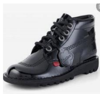
Patent Hi Ankle Kickers

Please note: If parents/carers are unsure as to whether a particular style will be accepted, they must send a picture of the shoe to the school before purchasing.