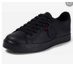
Kickers Low top Trainers