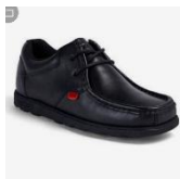
Kickers Lace Up Shoe