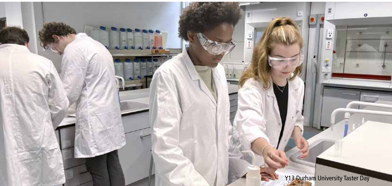
Y13 Durham University Taster Day