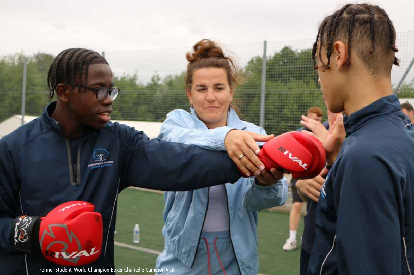
Former Student, World Champion Boxer Chantelle Cameron Visit