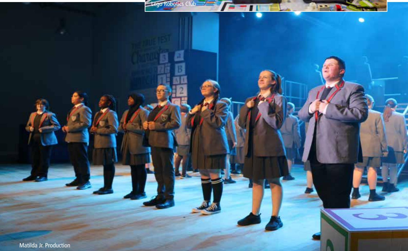
Matilda Jr. Production