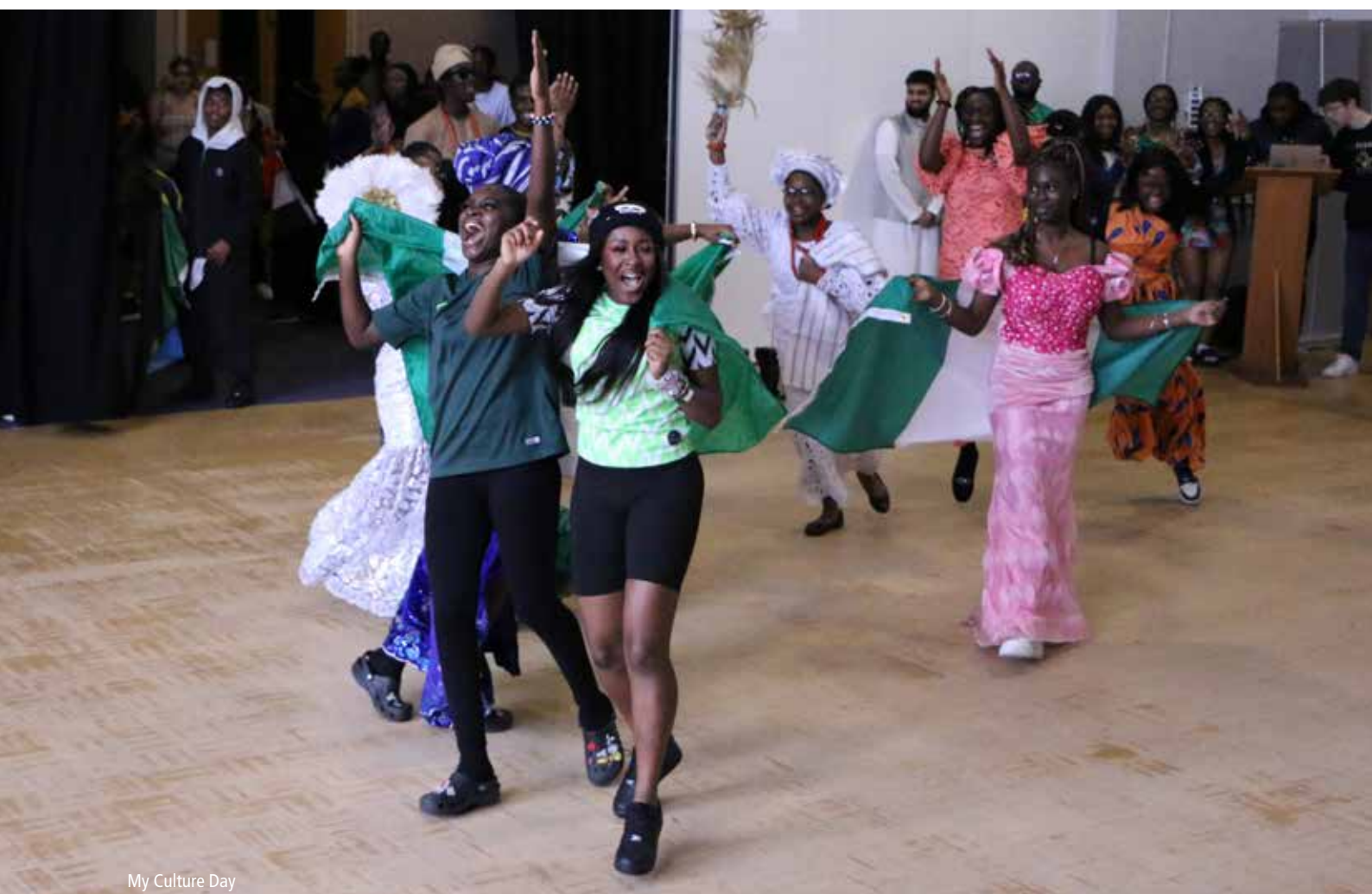
My Culture Day